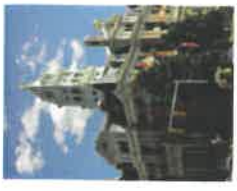
Auditor - Kevin Nye